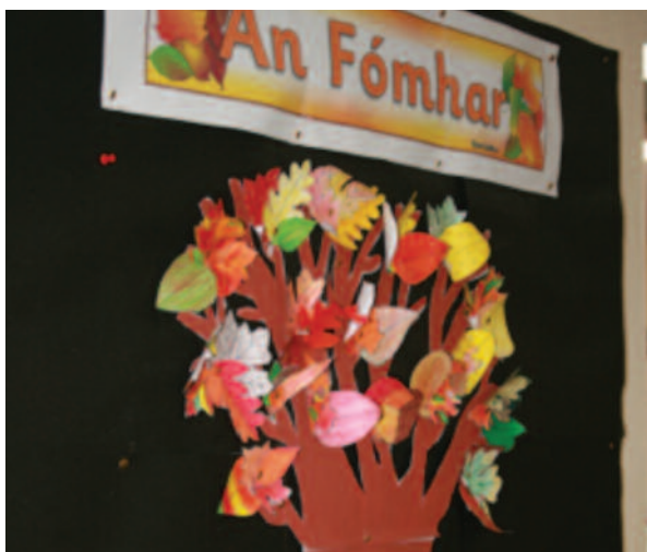
Artwork in rural school