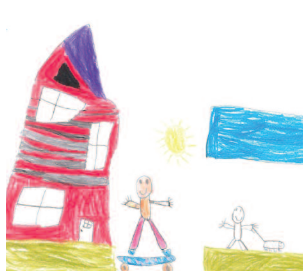
Town school, 5/7 year old boy. "I am skateboarding outside my house" and "My mum and I are walking the dog."