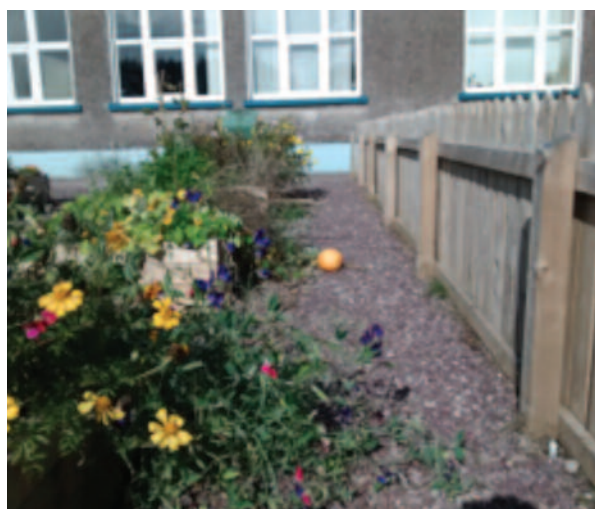
Town school rear view – school vegetable garden

The town school is located on country road leading out of a town, on a level piece of land. The school has a large concrete yard, half-circling around the front and the side of the school building. At the back of the