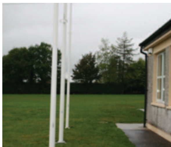
Rural school side view – sports pitches