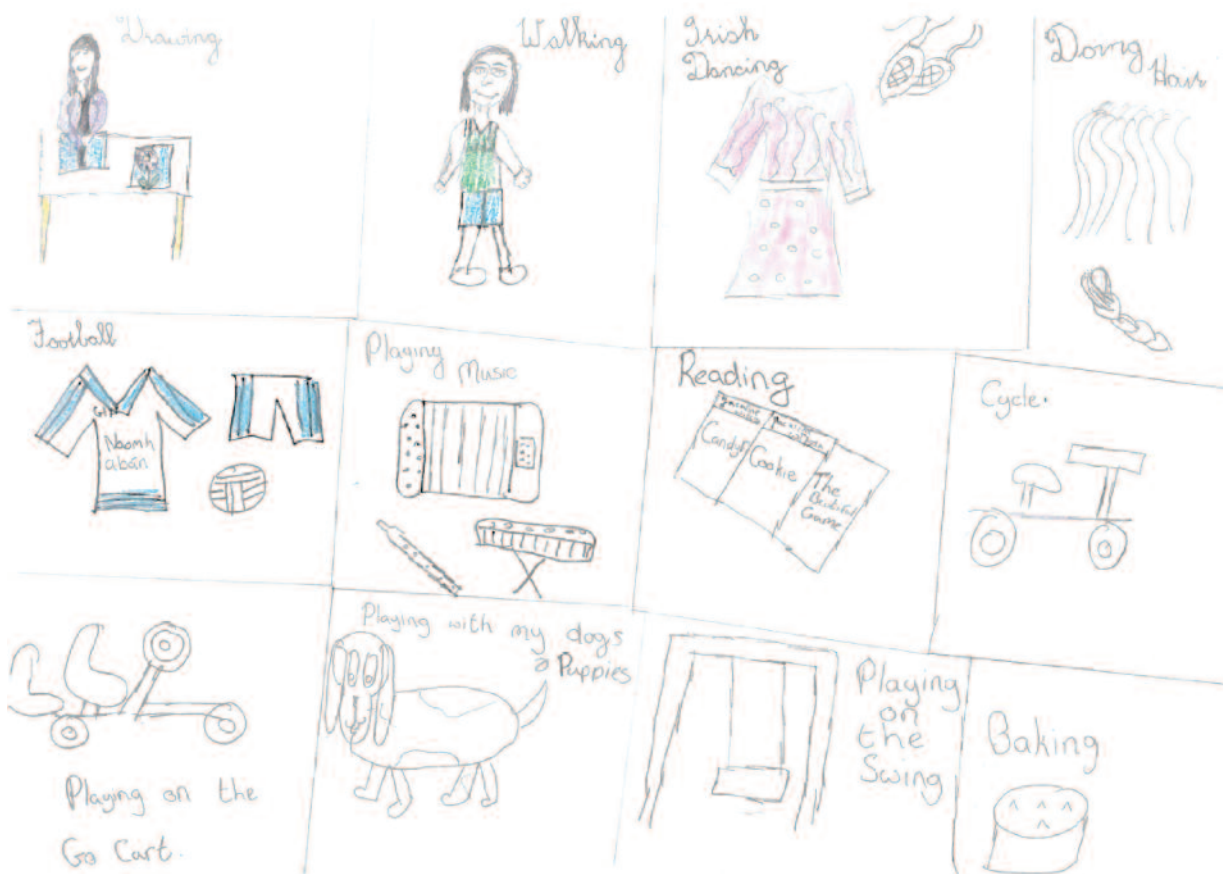
Rural school, 10/12 year old girl. "Drawing, walking, Irish dancing, doing hair, football, playing music, reading, cycle, playing on the go-cart, playing with my dog and puppies, playing on the swing, baking."

In the rural setting, among the thirty-five children whose drawings were included, there were five images of television watching (one in seven), and seven of computer or games console use (one in five). None of the two younger age groups in the town setting included television in their drawings, while almost half of the oldest group did (one in two). Computer use was low in all town groups, present in just one of the twenty-one Senior Infants', five of the nineteen second class (one in four), and just four of the 20 fifth class pictures (one in five). As shown in the table below, in the absence of prompts from the researchers, few children (6) spontaneously depicted nature. See further Table 4 in the Appendices.