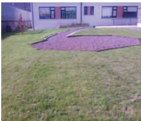
Town school rear view

Schools were both enablers and obstacles to children's enjoyment of the outdoors and natural heritage.