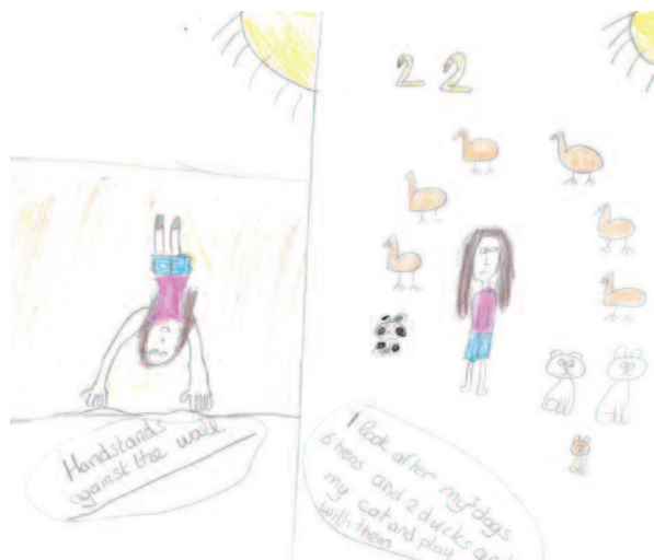
Town school 10/12 year old girl. "Handstands against the wall" and "I look after my 3 dogs, 6 hens and 2 ducks and my cat and play with them."

Television and computer use was also a point of difference. Of the twenty-four city children whose pictures were included, two depicted television (one in twelve), while eleven included images of computers and games consoles (one in two).