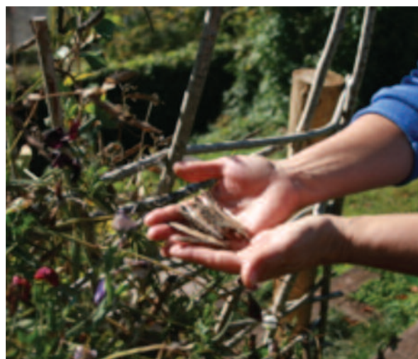
City school garden

spaces around their houses where they played, often with pets, and which sometimes also provided opportunities for reflection and observation: