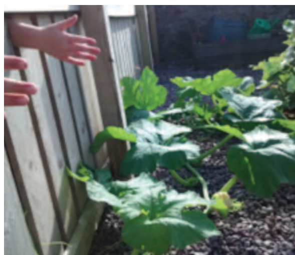
Fence protecting garden from school yard. Town school.